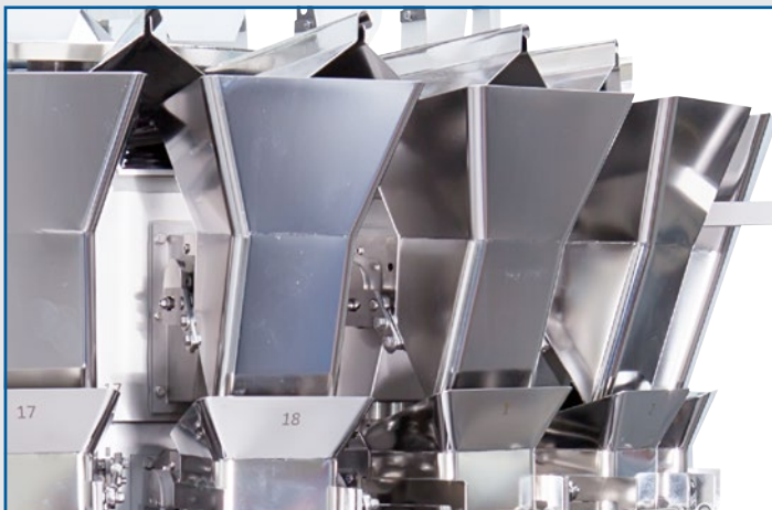
MultiWeigh® "Direct-Drive System", steppermotor operated hoppergates